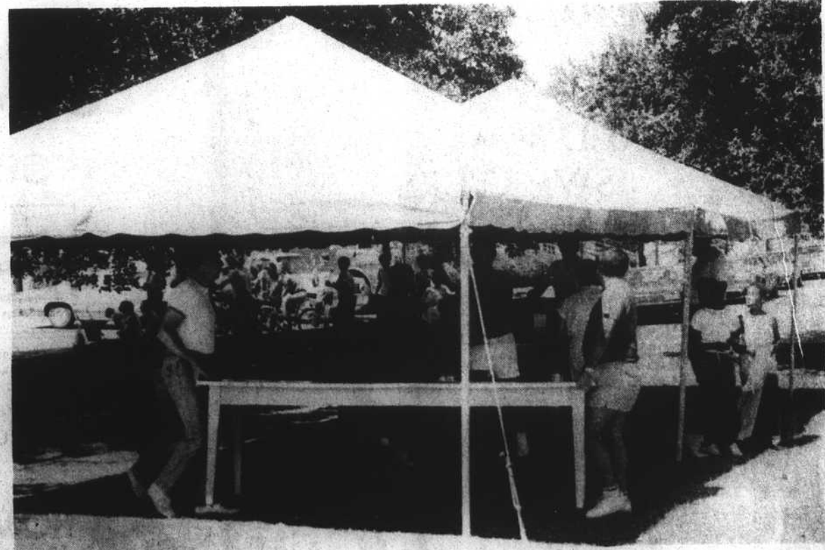
OPTIMISTS FOLD THEIR TENT —Optimists provided free refreshments to Labor Day celebrants Monday afternoon. Coca-Cola provided free drinks and radio station Z-102 broadcasted live from Colonial Park.

The purpose of the meetings is to discuss the forthcoming campaign and getting out the vote. All members of the precincts are invited and encouraged to attend.