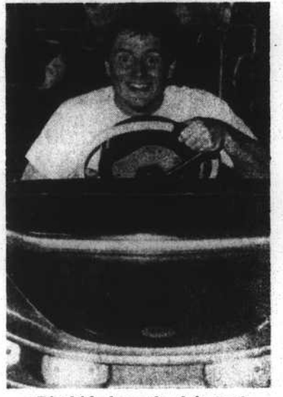
Big kids love the fair too!