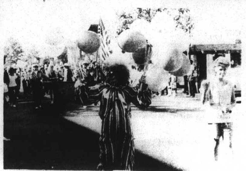
AND CLOWNS TOO—Parades feature floats, bands, horses and clowns. Saturday's Peanut Festival parade was no exception.