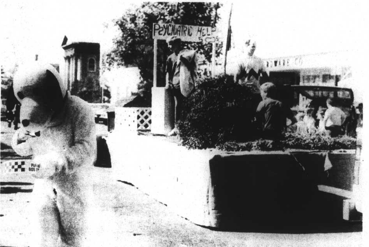
PEANUTS GANG—"The Peanuts Gang" was the appropriate theme for this float in the annual Peanut Festival Parade in Edenton Saturday. Tagging along was Snoopy. (More pictures on page 1B).