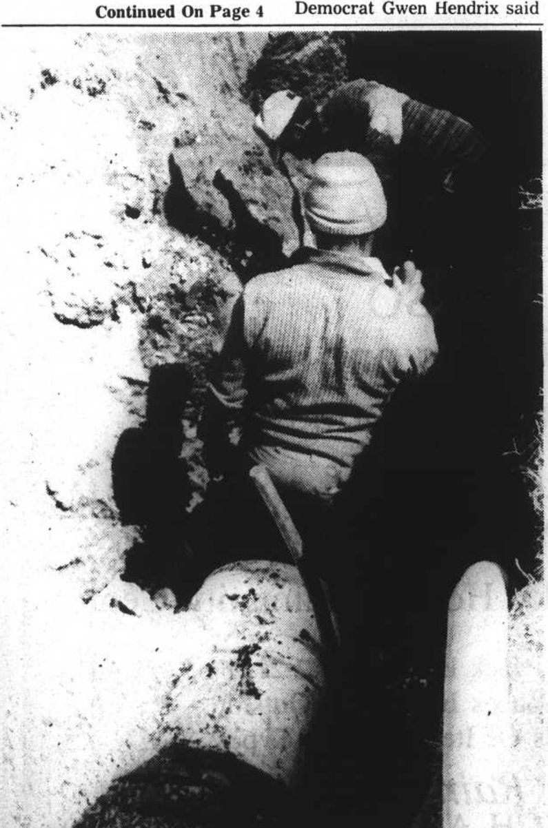
NEW SEWAGE LINES—Workmen were busy installing new sewer pipes at the corner of Granville and Water Streets this week. Residents have had to detour as some streets west of Broad have been blocked off to allow for the installation of the new lines which will connect with the waste water treatment plant to be completed early next year.

will be held at the Edenton United Methodist Church.