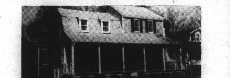
C93 THE LEIGH HOUSE, CIRCA 1759: is an Edenton historical landmark. The home has received National recognition and is significant architecturally for being one of three eighteenth century gambrel roof dwellings remaining in the town.....Phone For Particulars.