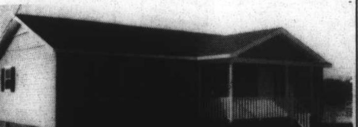
289 BRAND NEW: Ready for your immediate occupancy, three bedroom, two baths, central air and heat on spacious homesite in a country surrounding for only.....$54,900.