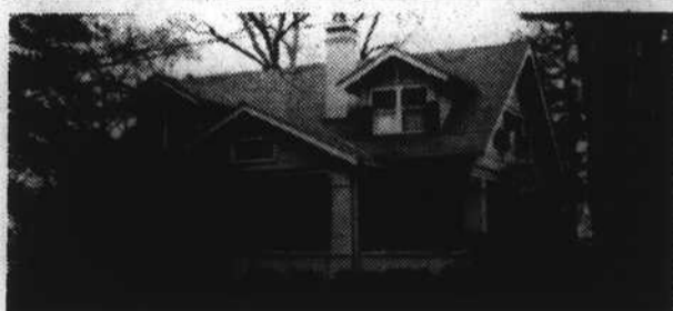
292 EXCEPTIONAL TOWN PROPERTY: Situated on three homesites in exclusive Edenton Historic District. Features living room with fireplace, exquisite dining room, butler's pantry, five bedrooms, two full and two half baths. Must be viewed to be appreciated.....$105,000.