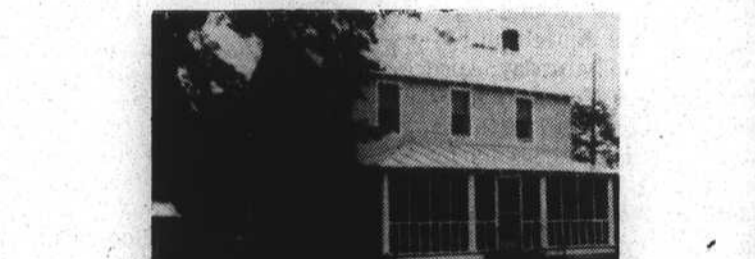
283 COUNTRY HOME ON OVER TWO ACRES: featuring three bedrooms, living room, kitchen, many extras including workshop. Modestly priced at.....$44,500.