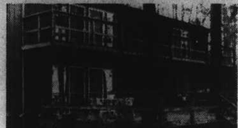
287 PANORAMIC WATERFRONT VIEW: of the Albemarle Sound featuring your own private beach. This spacious beauty offers four bedrooms, three baths, and two fireplaces.....$180,000.