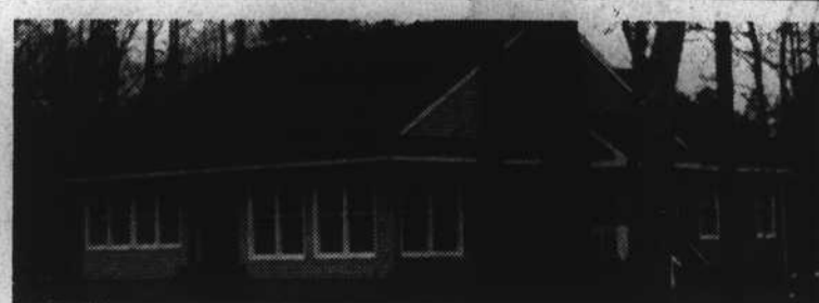
290 COUNTRY CLUB DRIVE: is the location of this beautiful three bedroom; two bath, featuring a beautiful great room with fireplace and complimented by a passive solar sun room. Situated on spacious corner homesite with beach and boating privileges.....$102,500.