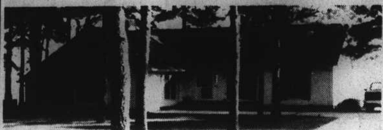
230 WATERFRONT TRADITIONAL: Single story residence situated on Albemarle Sound in exclusive neighborhood. Includes all amenities, three or four bedrooms, three full baths, living room, dining room, sunporch, deck, and pier.....$193,000.