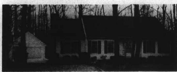
278 COUNTRY CLUB DRIVE/FAIRWAY DRIVE: Lovely home on wooded 1.3 acres. Features formal living room, dining room, study with built-in book cases and beautiful fireplace. Spacious garage with workshop. Beach and boat basin access.....$110,000.