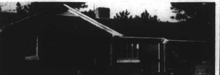
281 KIMBERLY DRIVE MORGAN PARK: Owner has reduced the price of this spacious beauty for immediate sale! Three bedrooms, two baths, gracious family room with fireplace, and carport with storage area.....REDUCED TO $81,500.