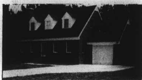
234 CIRCA 1985: Classic grandeur of Colonial Williamsburg architecture is recreated with exacting detail. This fine home features fireplaces in the living room and master bedroom. Also a formal dining room and spacious kitchen with built-in appliances. Superb spacious homesite.....$105,000.