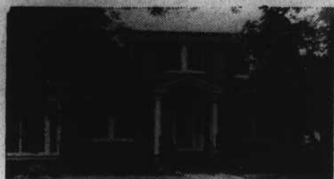
247 EXQUISITE: This home features an era gone by! Includes four bedrooms, entrance hallway, custom built-ins, high ceilings, insulation, swimming pool with elaborate decking and jacuzzi. Superbly situated on spacious corner homesite and includes guest home. One of a kind in Edenton.....$265,000.