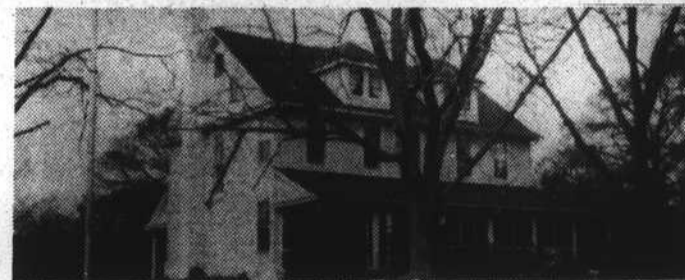
248 WATERFRONT MASTERPIECE: Situated on over three acres within Edenton's city limits overlooking Edenton Bay with deep water access to the Albemarle Sound. A choice opportunity to live life at it's fullest.....$425,000.