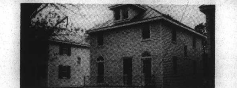
232 CHARMING TOWNHOME: Located in historic district. Fan windows, handsomely refinished wood floors, formal living room and dining room, sunroom with deck — All features of this delightful home in prestigious neighborhood can be yours for.....$125,900.