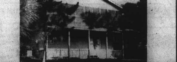
240 WATERFRONT: Located in Cape Colony. Three bedroom home with two baths in superb condition. Garage, living room and family room which opens onto porch with beautiful view of Sound.....REDUCED TO $79,900.