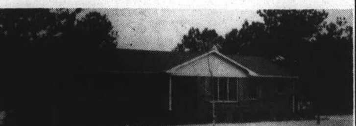
282 ROBIN LANE MORGAN PARK: Comfortable quality built home in a most desirable location. Your own three bedroom, two bath, with entrance foyer, formal dining room and spacious homesite.....REDUCED TO $81,000.