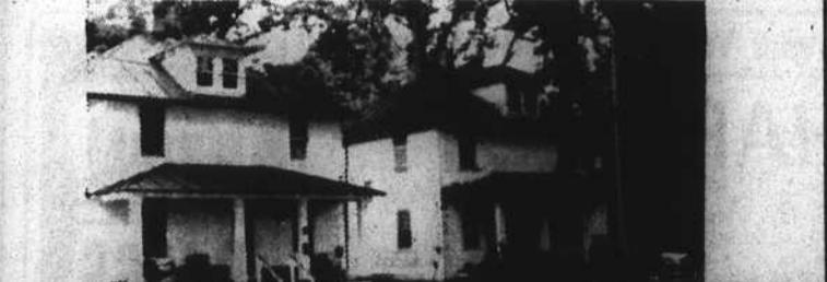
249 TWO RENTAL INCOME HOMES: Close to downtown Edenton. Featuring three bedrooms, living room, dining room and only....$40,000. for both!