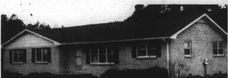
283 RIVERTON/CRESTWOOD LANE: Beautiful brick ranch in superb condition. Features spacious homesite, central air and heat, three bedrooms, two baths, lovely den; detached two car garage/workshop.....$88,500.