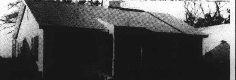
271 COZY CHARM IN FAMILY NEIGHBORHOOD: Attractively and tastefully remodeled in excellent condition. Owners job relocation requires an immediate sale and all appliances are included! Priced modestly.....$62,600.