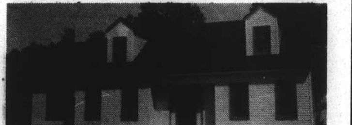
215 RIVERTON: Williamsburg style, lovely new three bedroom home is located on spacious corner lot in wonderful neighborhood. Living room, dining room, two full baths, den and large country kitchen.....$73,000.