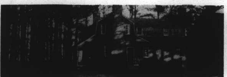
265 WATERFRONT SYCAMORE CIRCA 1718: Exquisite historical masterpiece is the true "Chance of a Lifetime to Own a Dream Come True!" Situated on a beautifully landscaped homesite; featuring a walk through flower and shrub garden; this four bedroom colonial masterpiece is situated on the majestic Albemarle Sound.