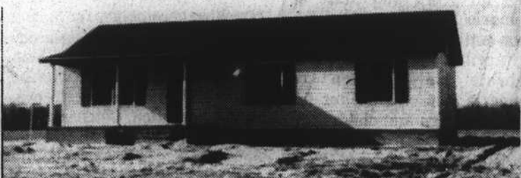
274 REFRESHINGLY CLEAN: and ready to move into! You won't believe your eyes when you see this brand new home situated in the county only minutes from town. Call Today For Appointment.....$50,900.