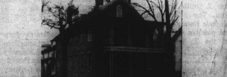
277 IMAGINATION: will turn this property into a unique investment opportunity for you! Features include new central air and heat system, storm windows, wiring, and plumbing for only.....REDUCED TO $31,500.