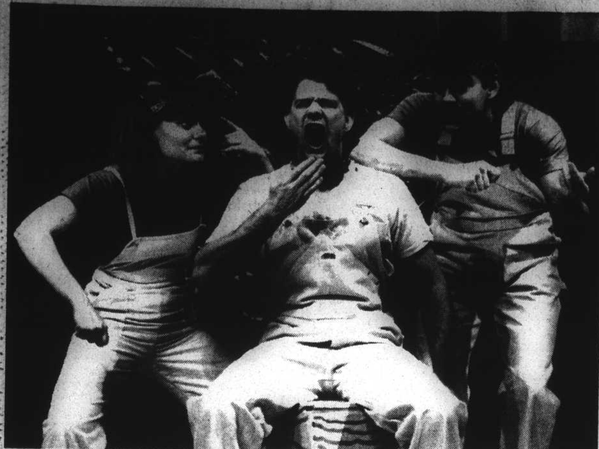
TREAT FOR SCHOOLCHILDREN—"Tarheel Tales", with a cast of six professional actors, will be presented to Edenton-Chowan schoolchildren in grades 1-3 on April 27. The performance is being sponsored by the Chowan Arts Council.