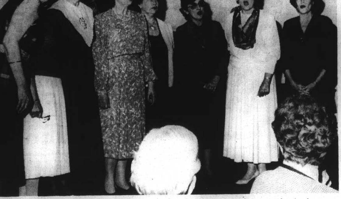
LOCAL SINGERS TO APPEAR-The Harmony Belles, a group of talented women who sing harmony in the barbershop quartet-style, will be among the entertainers at this year's May Play Day at the Rocky Hock Community Center. The event will take place on Saturday, May 2.