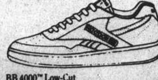
BB 4000™ Low-Cut

Quality Shoes Revue Downtown Edenton 482-3966