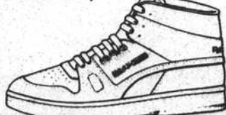
BB 6600™ Hi-Top