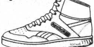
BB 4600™ Hi-Top