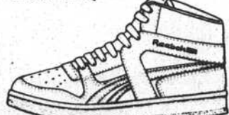
BB 5600™ Hi-Top