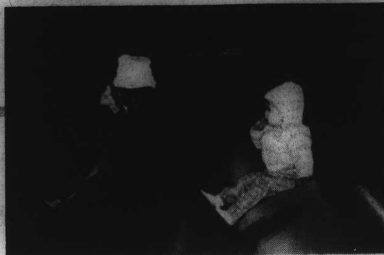
PAUSE —Tots pause in their enjoyment of bouncing in an amusement at the Chowan County Fair. Both are probably first-time fairgoers.