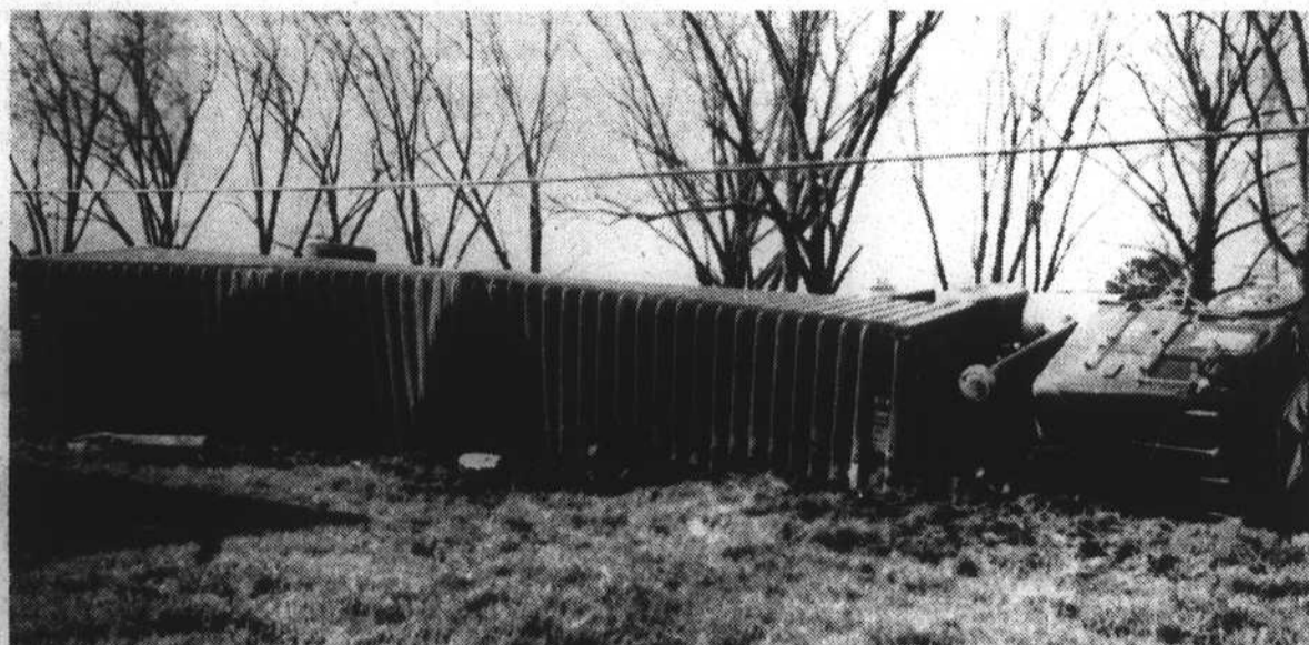
FOG VICTIM --Heavy fog last week may have contributed to an accident on N.C. 32 North that toppled this tractor-trailer truck early on Wednesday morning. The driver received only minor injuries but the truck sustained $10,000 in damage.