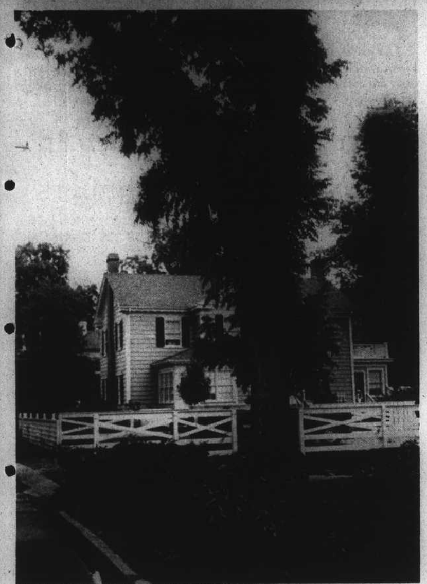
Trimmed excessively on the back, this tree on West Eden Street grew heavy on the front Friday, enough so to lose limbs, which fell across wires and cause two power outages during the day.