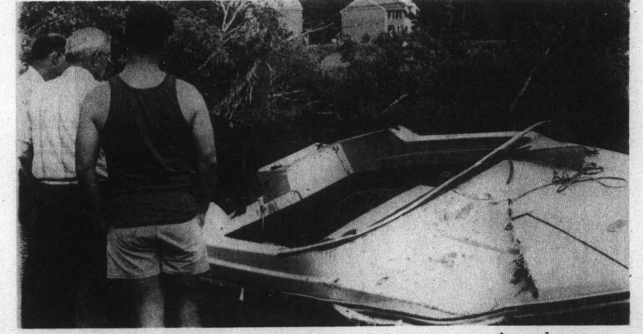
Law enforcement officers remind the public that "waterways can be as dangerous as highways" and that caution should be practiced on both.