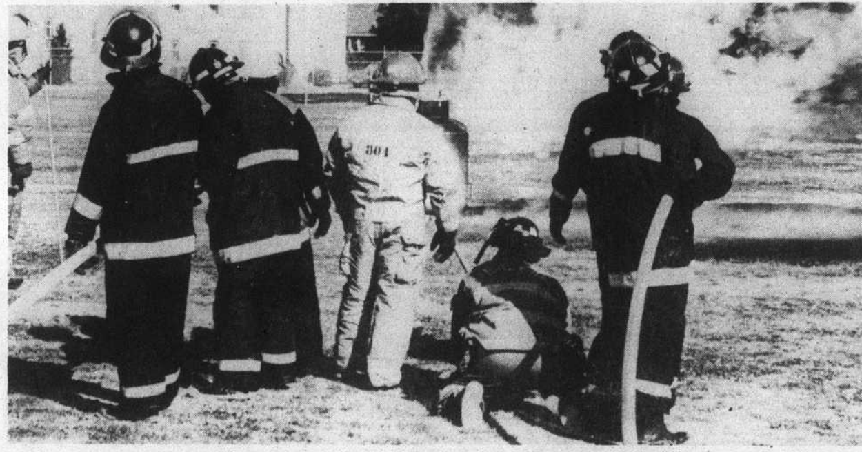
Firemen maneuver closer to extinguish a flaming LP gas tank Sunday morning during training exercises held here for the 10-county Albemarle Firemen's Association, which is comprised of 36 fire departments.