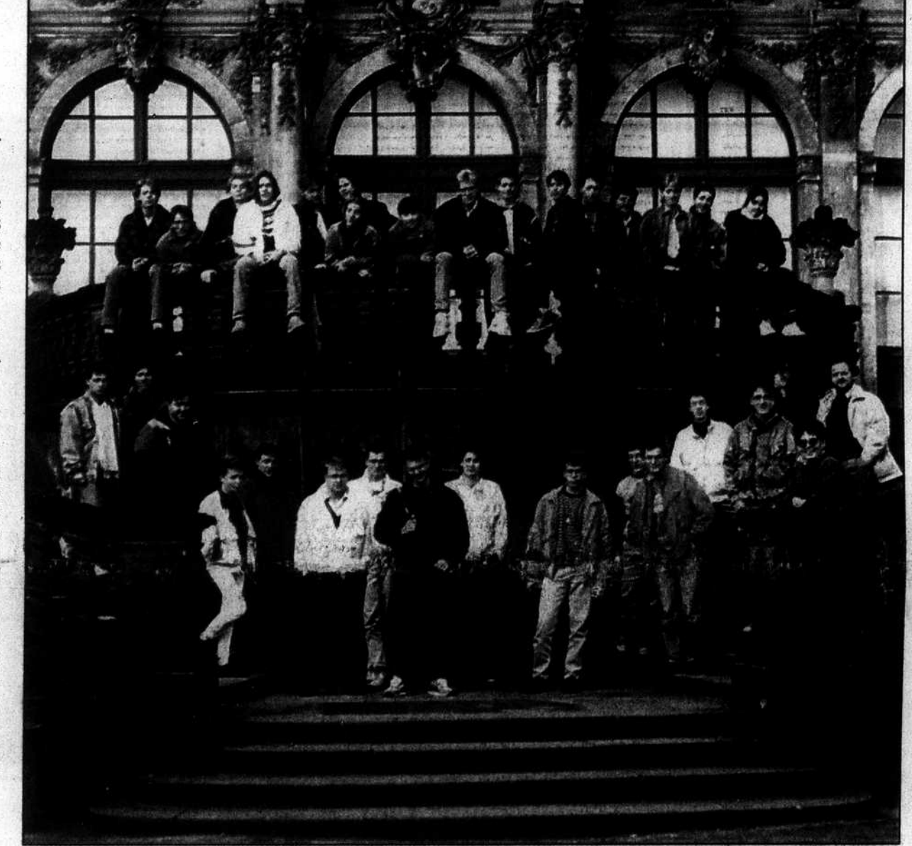
GERMAN ORCHESTRA TO PERFORM HERE

The Ulmer Knabenmusik, an all-male German orchestra, will perform at Swain Auditorium on Thursday evening, May 22, at 8 p.m. A reception will follow. On Wednesday evening, the public is invited to attend a soccer game and hot dog picnic at the Edenton Methodist Church grounds in which the musicians will participate. Tickets for the concert can be obtained by calling the Chowan Arts Council at 482-8005. (Submitted photo)