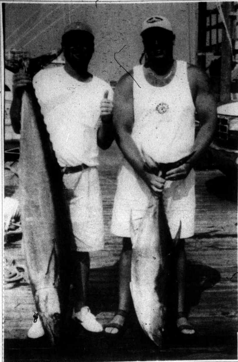
ALL IN A HARD DAY'S WORK

For more information, contact the Senator Bob Martin Eastern Agriculture Center at (919) 792-5802.