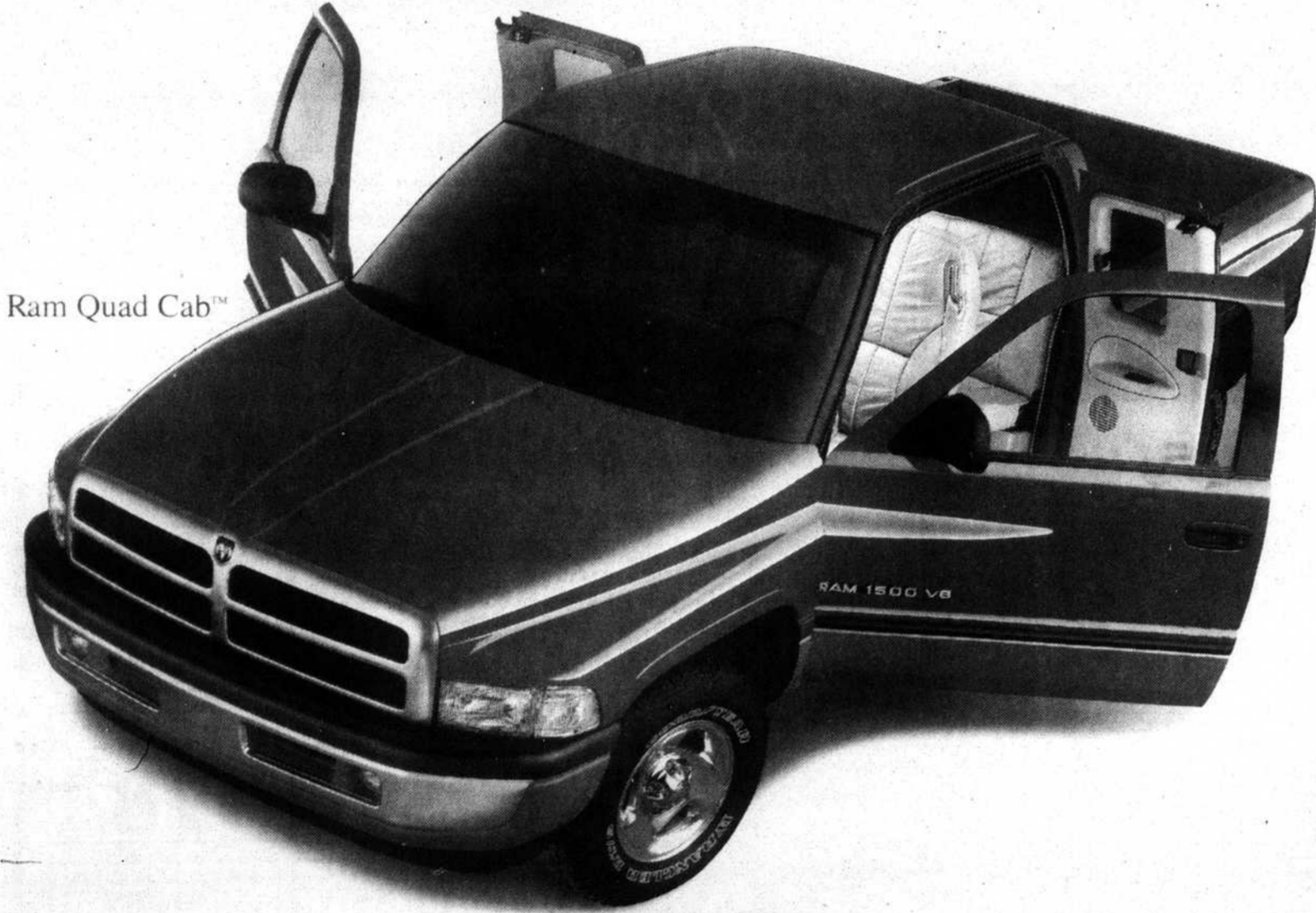
Ram Quad Cab™

Now the truck that changed the rules is fourmost in accessibility with something no other pickup can beat. Introducing the new Dodge Ram Quad Cab ... the industry's only half-ton extended cab with four doors, ... and the roomiest 1500 on the road.