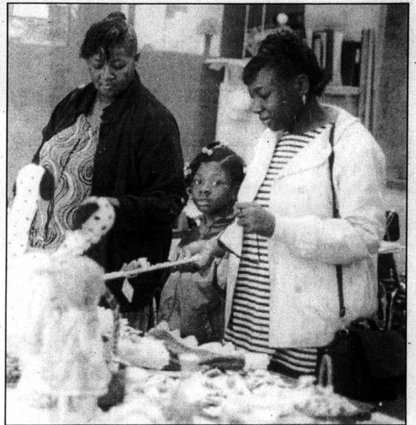
PTA SPONSORS FUNDRAISER