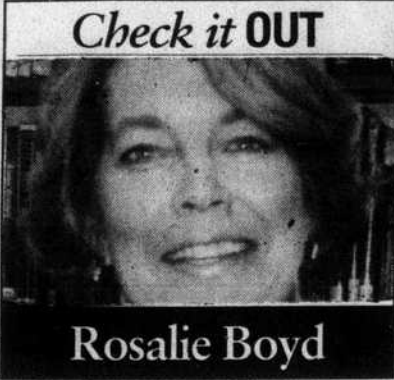
Check it OUT