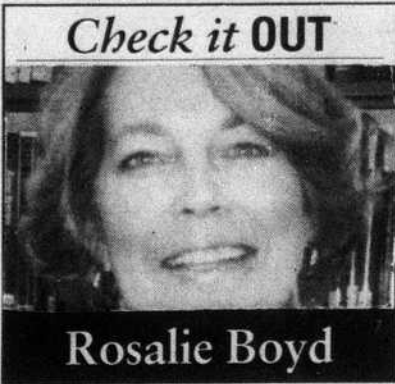
Check it OUT

We are developing a "Listening Library" of high-interest books with accompanying unabridged tapes for younger kids through middle school readers. These book-and-tape kits can benefit beginning readers and students with reading disabilities, or serve as fun and reinforcement at home or on car trips. Thirteen kits are available now. The purchase