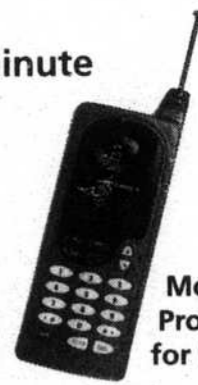
Motorola Profile™ 300 phone for $9.95

includes 100 wireless minutes a month and residential long distance as low as 9¢ per minute and unlimited paging at no extra charge plus if you sign up now, you get 300 bonus wireless minutes.