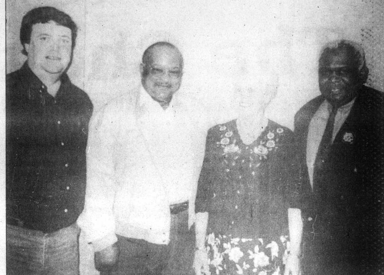
FOUNDATION GREETS NEW MEMBERS

Pettigrew Regional Library Board meeting, Monday, May 17th at 7:00 p.m. at Shepard-Pruden Memorial Library.