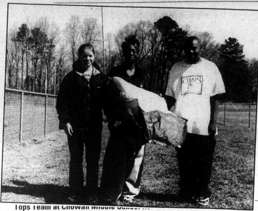
Tops team at Chowan Middle School.

Friday: Breakfast - Scrambled eggs and toast, milk and juice. Lunch - Pizza or hot dogs with green peas, diced pears, milk.