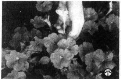
Remove faded flowers to help your remaining flowers thrive.

Water is crucial to most annuals and perennials. Petunias and impatiens are quick to wilt but are forgiving if you water them promptly. Caladiums are not so forgiving; let them wilt down and they may go dormant! Your persistence with regular, deep watering will give plants the ability to hang on through hot weather stress. Flowers in containers can be