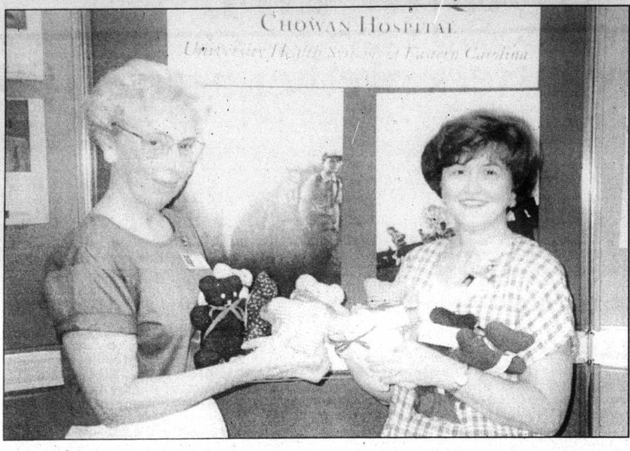
HELPING TO EASE A CHILD'S FEARS

Want to stay informed about upcoming events? You can when you pick up the Herald weekly at your favorite store!