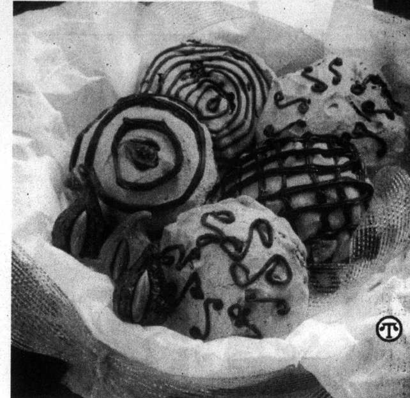
Festive Fig and Hazelnut Mocha Meringues are a great way of sharing your good wishes for the new year with a special friend or neighbor.

1 cup chopped (1/3-inch) Mission about 16-18 (2-inch) circles. Smooth or Calimyrna Figs, stems removed 1/2 cup chopped hazelnuts or