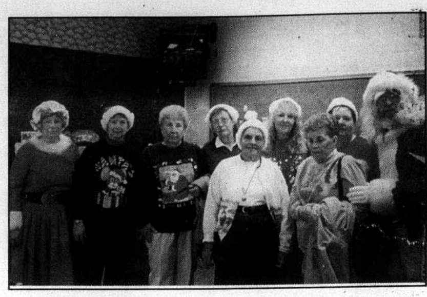
American Legion elves join Santa Claus in sharing the joy of the holiday season during visits to area schools and nursing homes.

The Legion family elves and Mr. and Mrs. Claus also visited with the veterans in our area nursing homes. Mr. and Mrs. Claus brought them Christmas cheer, a stocking full of goodies, a present just for them and their favorite fruit, ba-