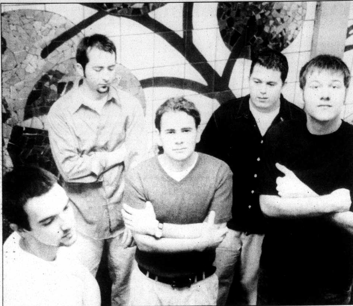
Puddleglum will be featured at the Summer Jam to be held in Edenton on July 5 (Submitted photo)