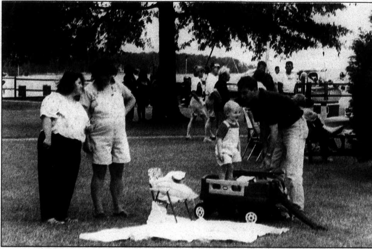
Bringing family and friends together for a day of outstanding entertainment, games and fun is what the Optimists' Fabulous Fourth is all about. There will be fun, games, music and more.

The live stage show will feature a variety of entertainments including rock, hip-hop, gospel, contem-