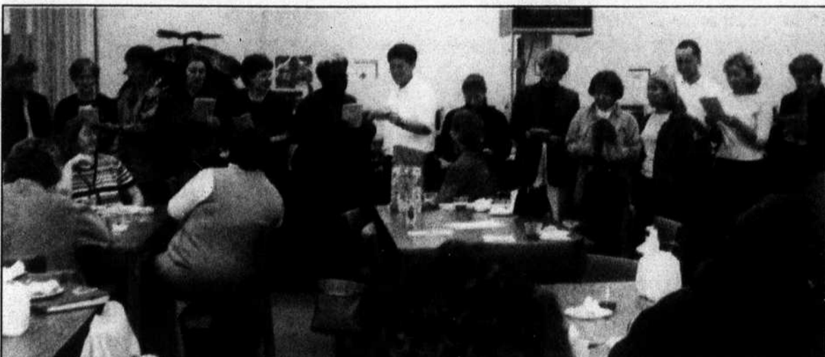
Third-year teachers, their mentors, and school principals in the Edenton-Chowan school system gather to recite the teacher's pledge at the Initially Certified Teachers/Mentors Celebration held at John A. Holmes High School May 30.

One of the ways the local school system has managed to deal more effectively with that situation is to have put a mentoring system into effect that pairs first-time teachers with more experienced