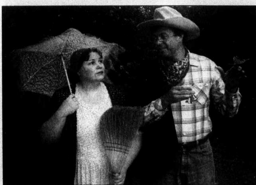
"Bright New Wings" the newest live drama by Emmrich Theatre Production Company is scheduled to open this coming Thursday at the newly renovated Rocky Hock Playhouse just off Rocky Hock Church Road and Evans-Bass Road in Chowan County.