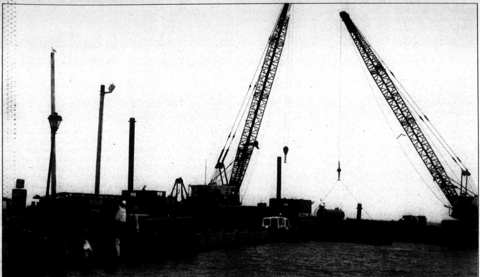
Construction equipment is becoming a familiar sight on the downtown Edenton waterfront as Waff Construction works to complete a breakwater and install boat slips. Soon, a large barge will be brought in to protect the ongoing construction.