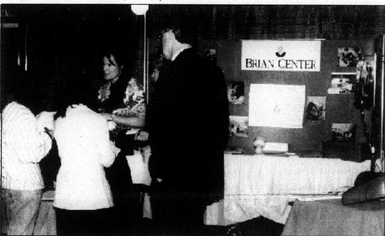
Representatives from Brian Center Health and Rehabilitation answer questions during the 1999 Job Ready Business Expo.

At the completion of the seminars, students will return to their home schools for lunch and dismissal.