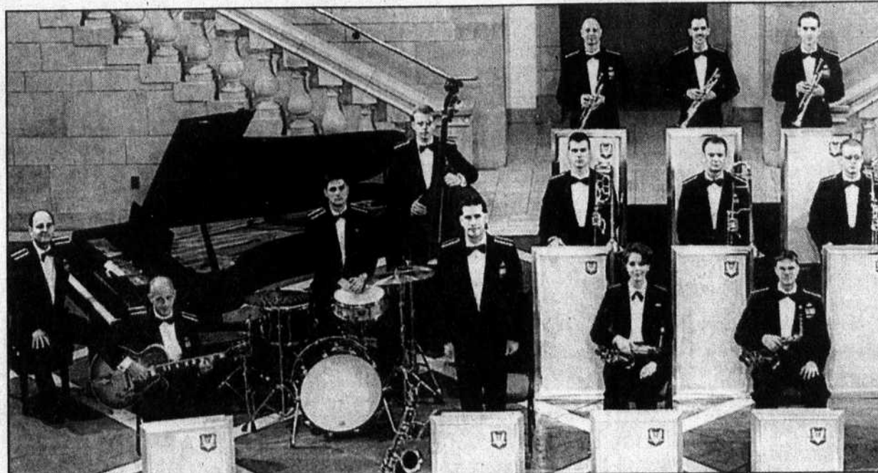
The U.S. Air Force Rhythm in Blue Jazz Ensemble will perform in Edenton on November 17th

For more information, contact the CAC at (252) 482-8005.