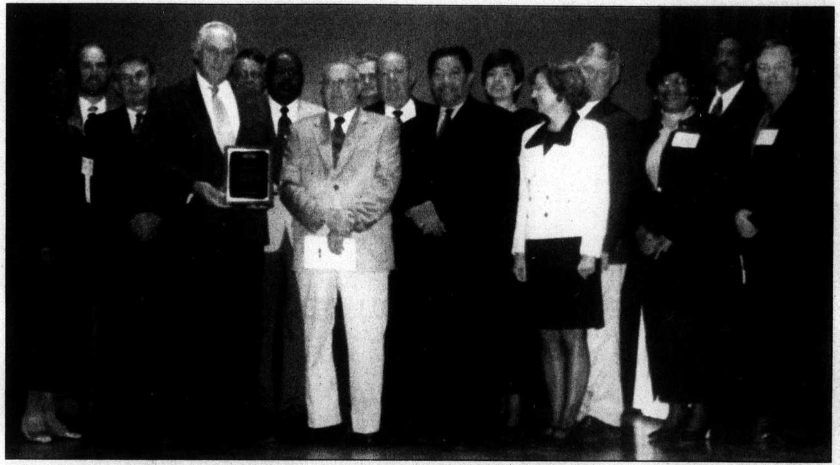
Chowan County Commissioners are joined by members of the Edenton-Chowan Board of Education as they accept the 2000 North Carolina School Boards Association County Commissioners Award for outstanding support of public education. The award was presented during an awards ceremony held in Greensboro on Nov. 13.