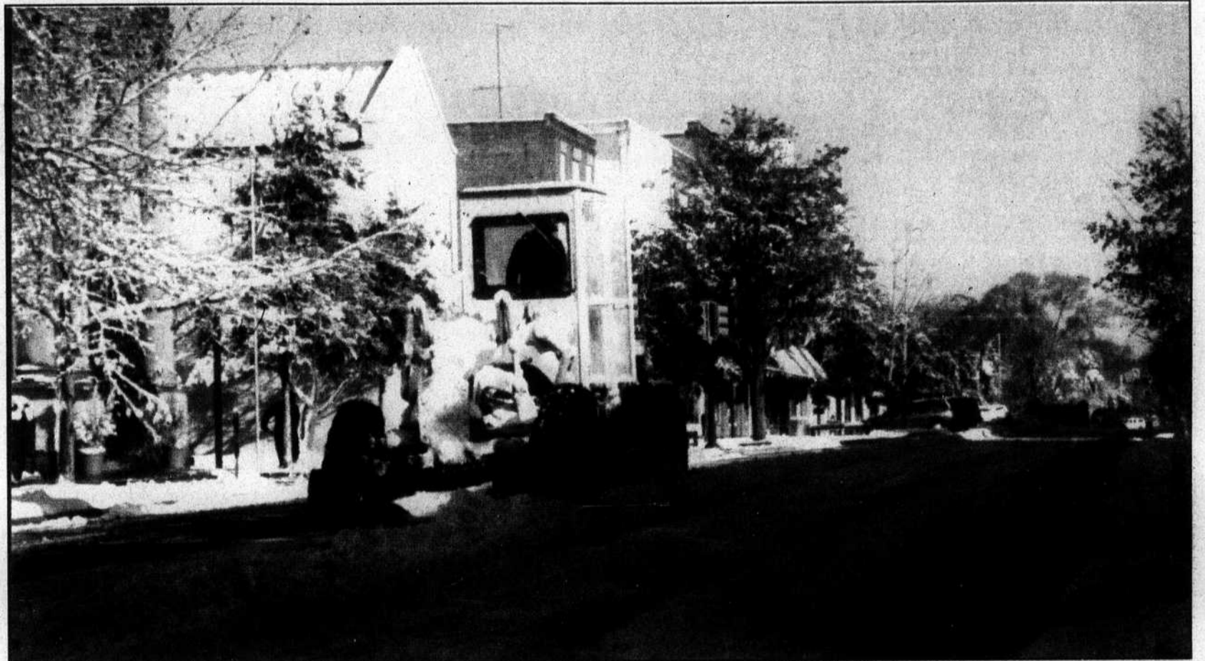
Road crews were hard at work on Monday morning, clearing accumulated snow and ice from Broad Street in downtown Edenton. Estimates are that seven inches of snow fell across the community on Sunday.