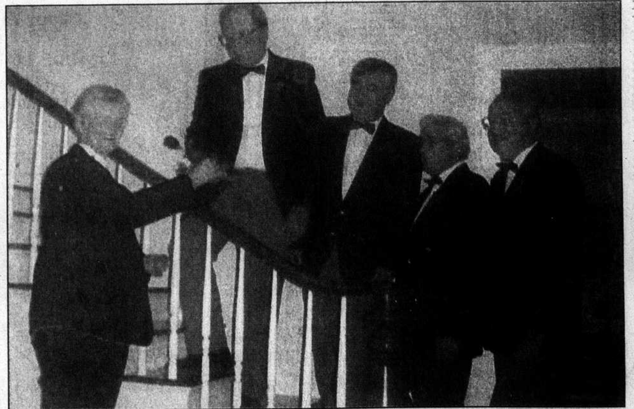
Thrill a loved one with a red rose and two love songs delivered anywhere in Chowan or Perquimans County by a quartet from the Albemarle Sounds. Place your order by Feb. 10 for delivery on Feb. 13-14. For pricing information, call 482-7475. All proceeds benefit vocal music programs in the local schools.