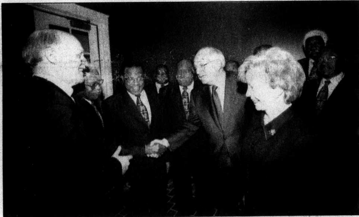
Vice President Dick Cheney is accompanied by his wife, Lynne, as he greets those attending the Congressional Institute gathering, including members of the Edenton Community Male Chorus who performed for an audience that included Cheney, his wife, former administrator of the National Endowment of the Humanities, and U.S. House Speaker Dennis Hastert of Illinois.