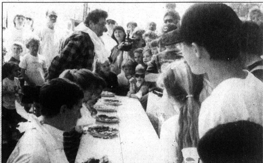
A pie eating contest is just one of the fun events at May Play Day, set for May 5 this year