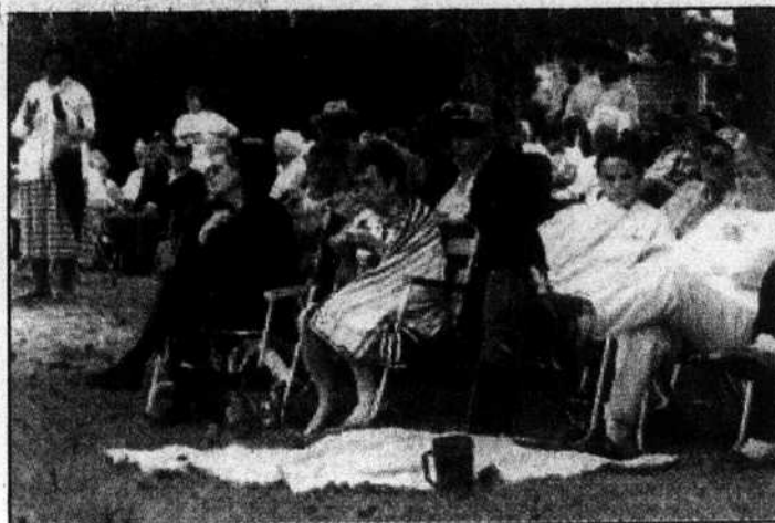
Music lovers of all ages attended last year's free Community Music Festival in the Edenton waterfront park. This year's festival will be held this Saturday from 4-7 p.m.

The festival is sponsored by the Chowan Arts Council, Albemarle Boats, Camp