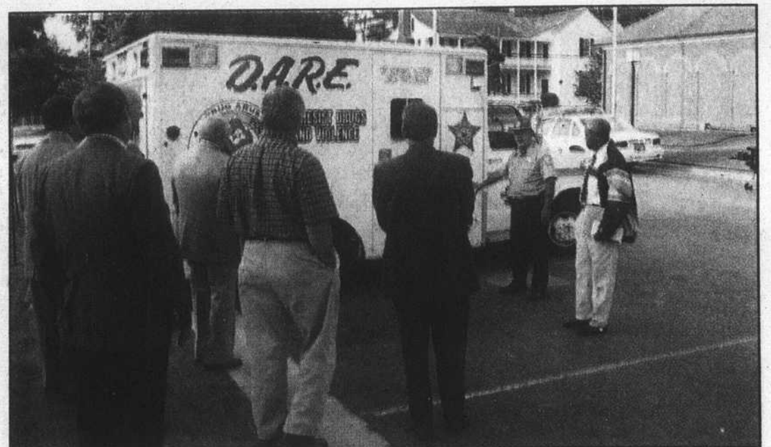
Local officials are invited to view the new DARE mobile unit for Chowan County