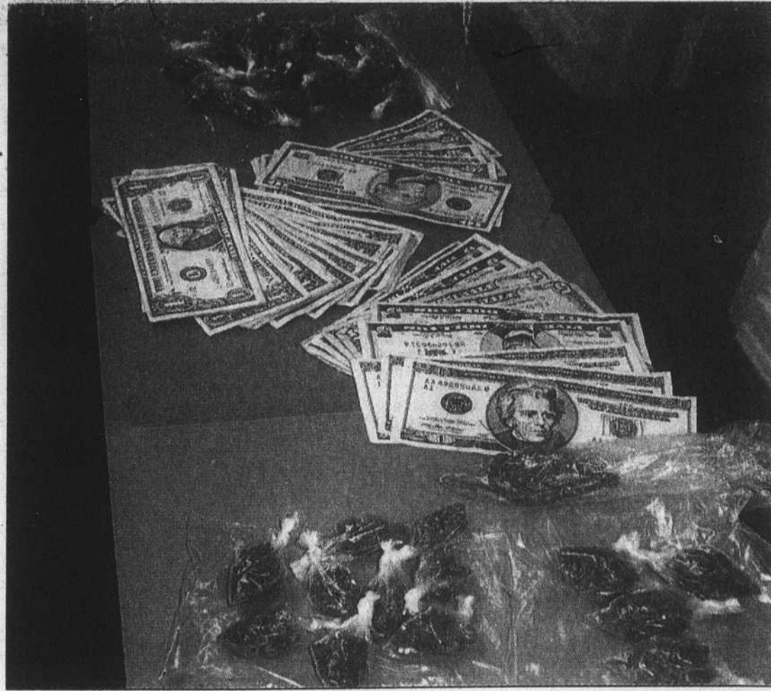
Two Edenton residents are facing charges after a search of their home turned up a large amount of cash and baggies of marijuana "buds" in a closet.