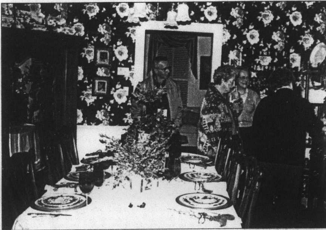
Thousands of visitors come to Edenton each year to enjoy the beauty of the holidays during the Christmas Candlelight Tour. The annual event will take place this Friday, Dec. 14, and Saturday, Dec. 15 from 4 p.m. until 8 p.m. Many related special events are also planned.

Local residents are also welcome at these events, and are cordially invited to attend.