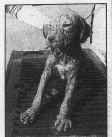
One of several pups abandoned locally.

Four puppies, about 3 months old, had been abandoned near an uninhabited house at 321 Indian Trail. "The circumstance these puppies were found in was pitiful," says Bass. "There was neither food or water." Worst of all, the four puppies skin was so