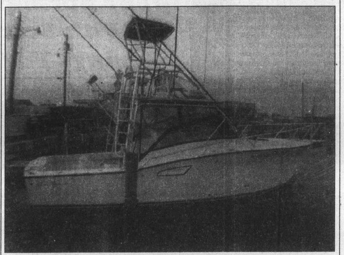
Albemarle Boats, which makes the 30-ft. 305 Express trawler shown above, will be among the participants in the first time show planned here.

Cuffie eventually complied See ARREST On Page 8-A