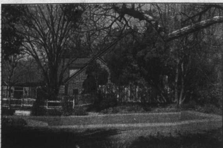
This simulation reflects the proposed new design for the Shepard-Pruden Library expansion.