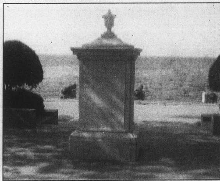
A special ceremony of tribute and remembrance will be held July 4 at the site of the Joseph Hewes monument on the Edenton waterfront.

In late October or 1779 Hewes resigned his congressional seat as illnesses had plagued him for much of the past three years. He remained in Philadelphia, to weak to return to North Carolina. Hewes died in November of that same year and is buried at Christ Church.