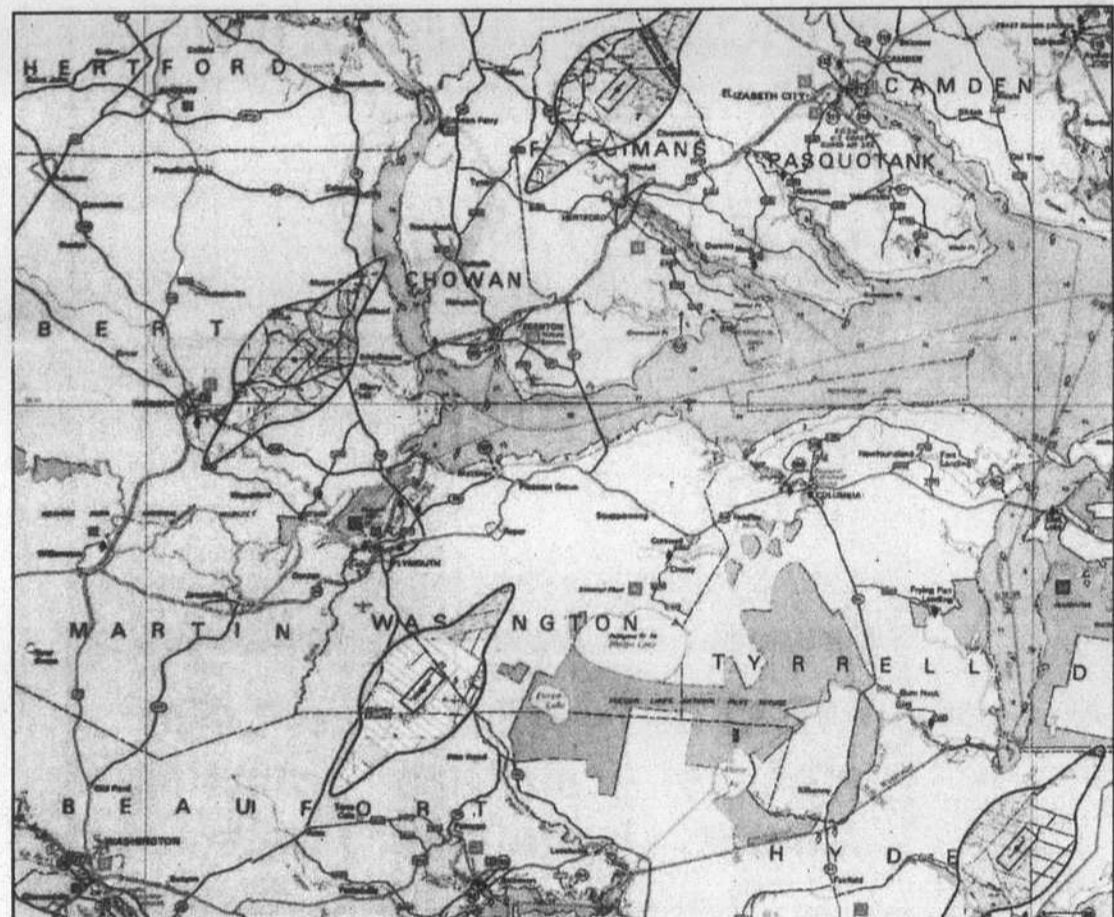
This map shows the estimated 65 dB DNL sound curve of the proposed OLF. The Navy wants to build their touch and go practice at one of these sites. These sound lozenges were calculated using the acoustical characteristics for the older model F-18. The newer F-18s that will be practicing day and night are reportedly much louder. Flight paths from NAS Oceana are not shown.