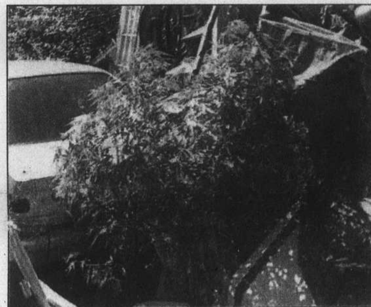
These are some of the six-foot tall marijuana plants confiscated by the Chowan County Sheriff's office during a Wednesday morning search of a Tyner residence. Officers, acting on information, recovered a number of plants and an assortment of drug paraphernalia. (Submitted photo)