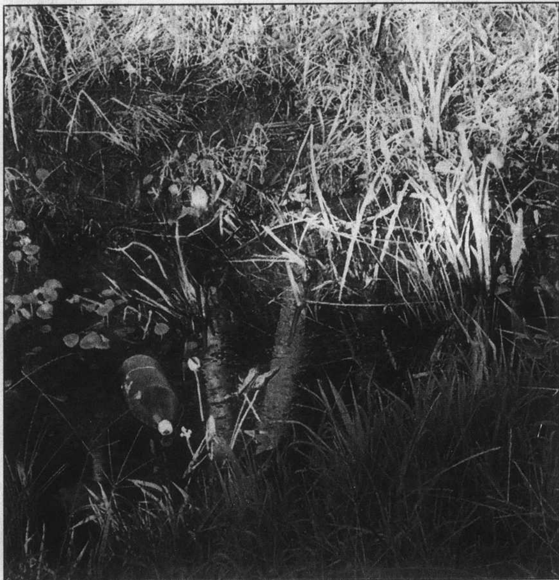
Standing water in fields, around homes and barns, or along roadsides create the perfect breeding environments for mosquitos. Homeowners are advised to check for areas of standing water in their yards that may draw mosquitos as well.