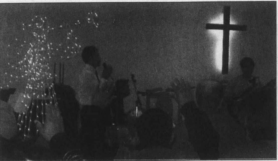
Faith Fellowship opens its doors to Chowan County's Hispanic community