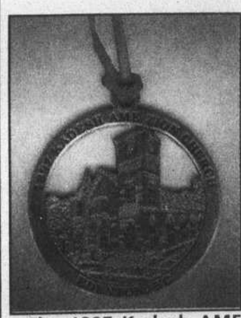
The 1897 Kadesh AME Zion Church will be the focus of this year's Kiwanis Christmas medallion.