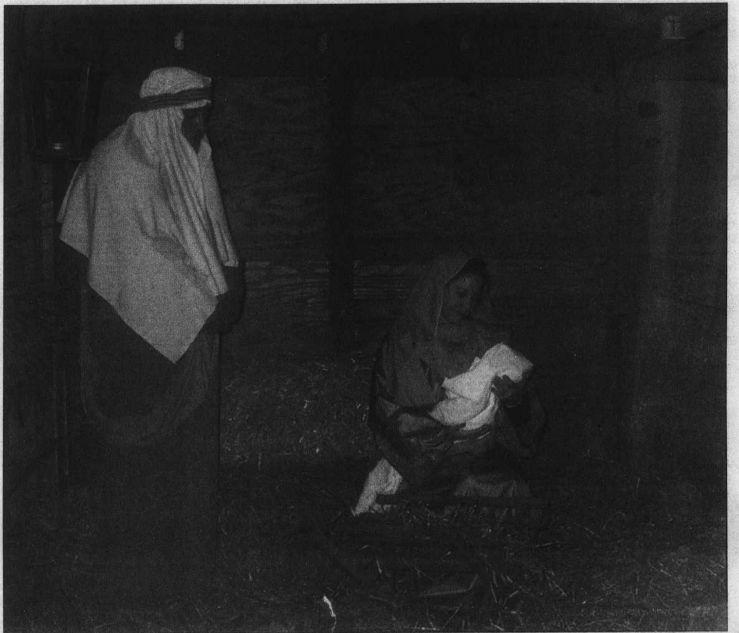
Mary gazes lovingly at the baby Jesus as Joseph tenderly watches over them in one of the most popular scenes from the Center Hill Christmas Panorama which brings alive the spirit of the holiday season.

This marks the fourth year that the panorama has been presented in Tyner.