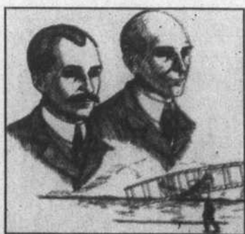
Orville and Wilbur Wright