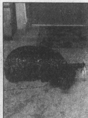
These two family pets had to be destroyed at the Chowan-Gates-Perquimans Animal Shelter after they were found to have fought with a rabid raccoon inside their fenced-in yard.

against the virus she had no choice but to put the dogs down.