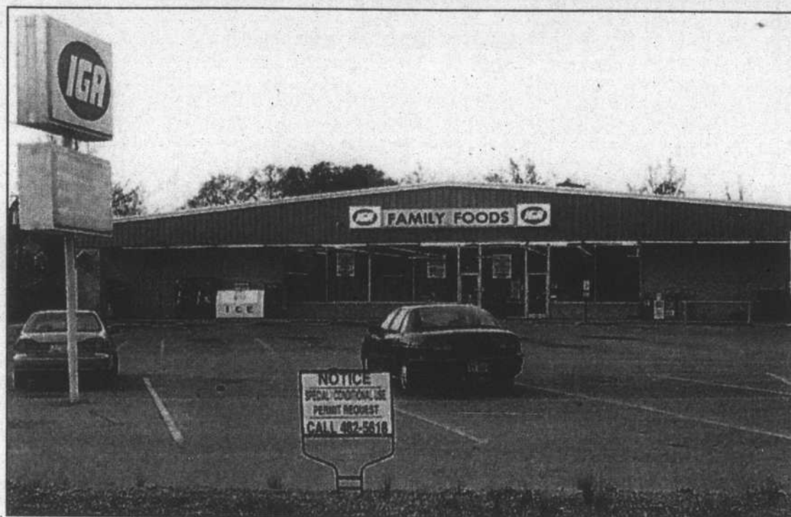
A permit granted Monday evening opens the way for Dollar General Stores to open a second location in Edenton, replacing the IGA grocery store currently housed on West Queen Street.

"I realize that some people are worried about losing the